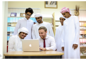
They always listen carefully.